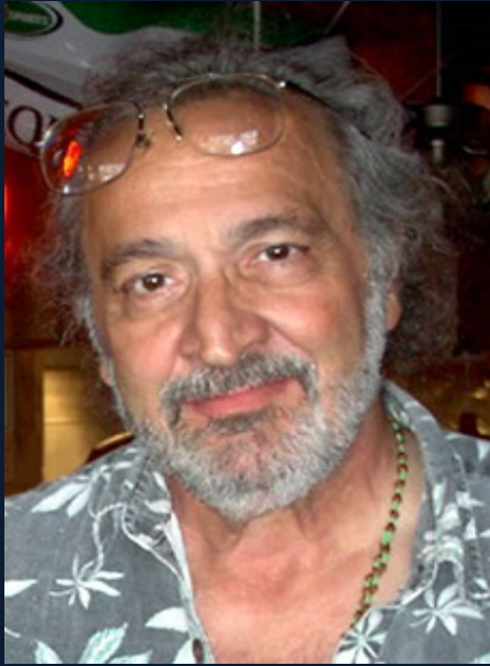
Jack Herer takes Time 4 Hemp.